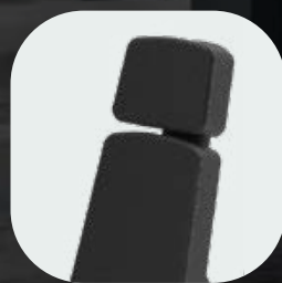
Carbon fiber finish