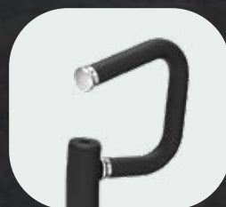
Non-slip PVC grips with aluminium caps