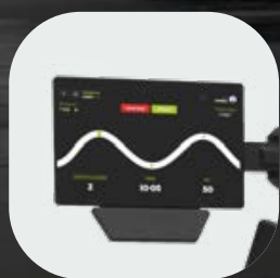
Connectivity pack screen 9" and NFC (optional)

This new line is a selection of Bodytone's premium strenght machines, focusing in the user for an excelent training results. Discover all >>>