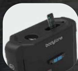
Bottle and mobile holder