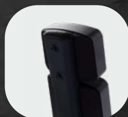
Upholstery ABS covers