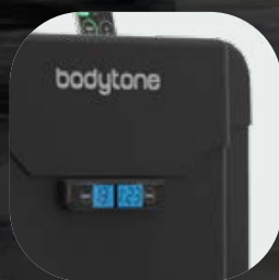
High quality termoplastic covers