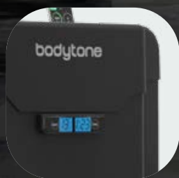
High quality termoplastic covers