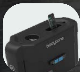
Bottle and mobile holder