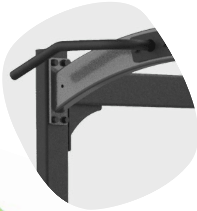
KNURLED DOMINO GRIP