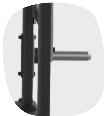
STEEL STORAGE BRACKETS