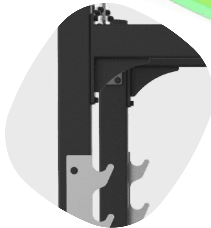
STURDY AND FIRM STEEL STRUCTURE