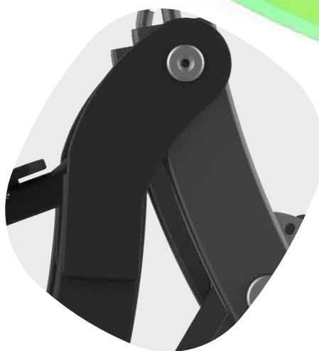
ROBUST AND FIRM STEEL STRUCTURE