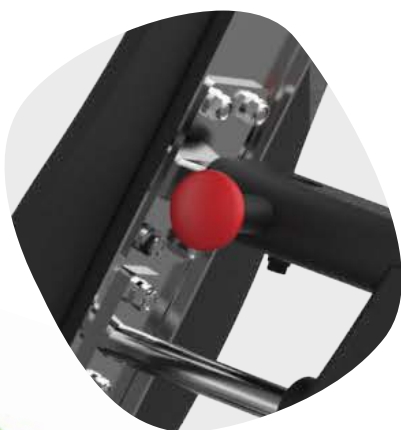
ADJUSTABLE SEAT IN VARIOUS HEIGHTS