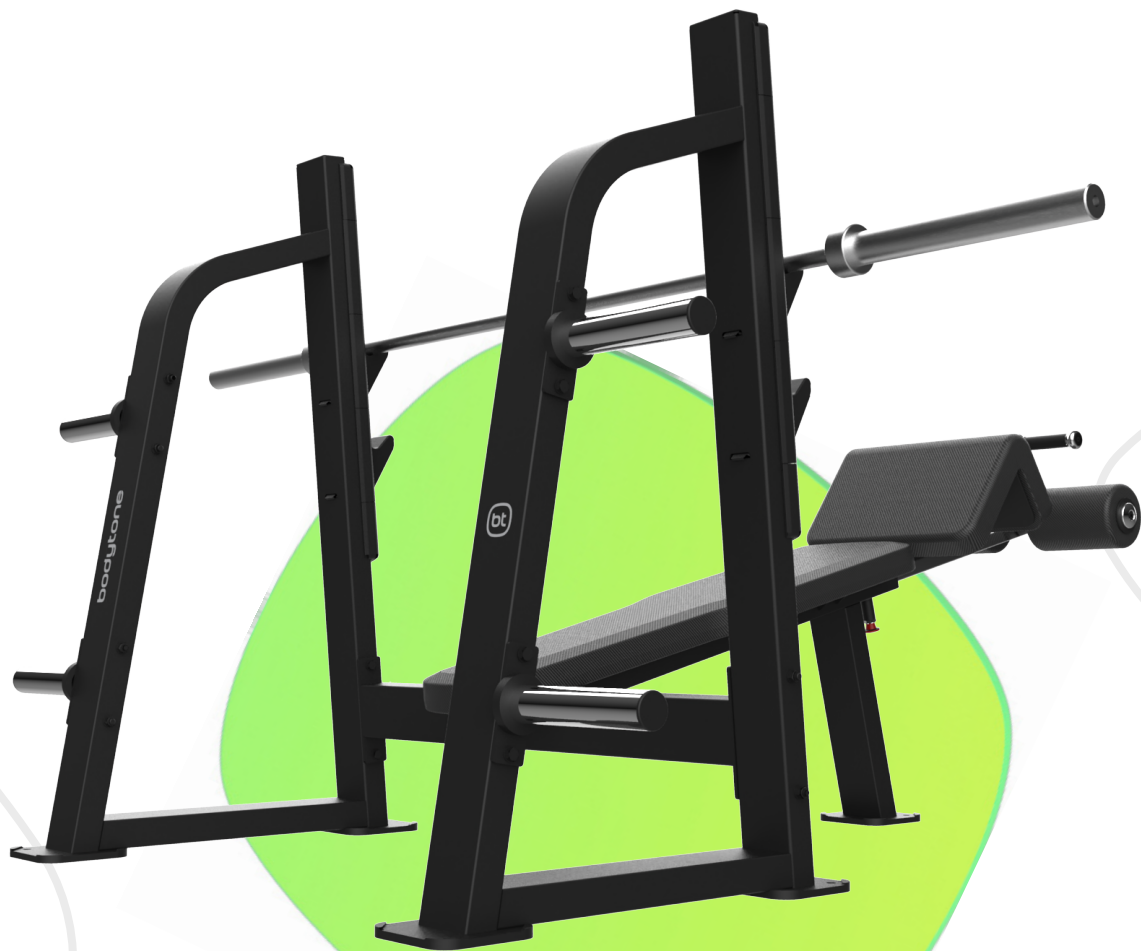
FBC06 OLYMPIC DECLINED PRESS

Biomechanic and ergonomic study, under the supervision of professionals and associated athletes. After a long design period – through drafting, engineering research, prototype production, and testing by professional athletes – our products go on sale.