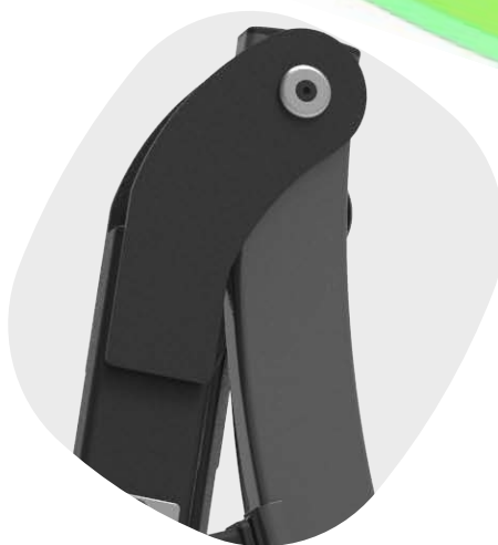
STURDY AND STRONG STEEL STRUCTURE